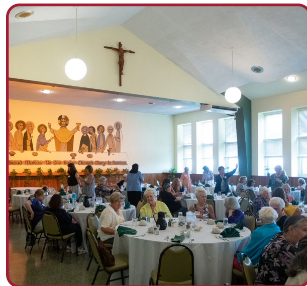
Our Dining Room can accommodate up to 300 guests