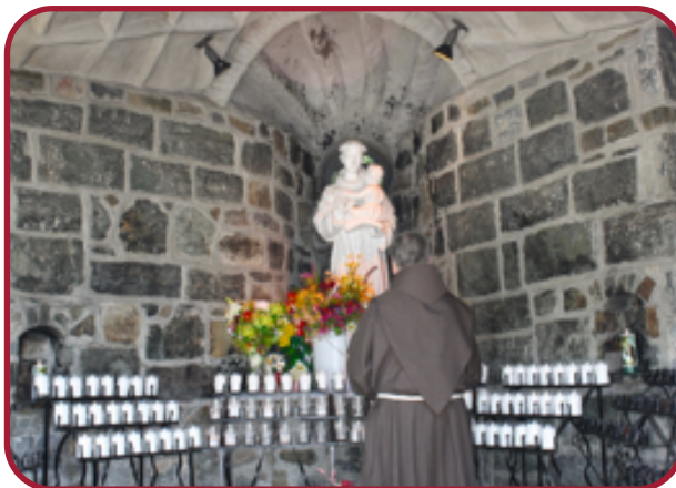
St. Anthony's Candle Shrine

Graymoor is located on Route 9 in Garrison. We are 1-hour north of New York City; 5 miles north of Peekskill, NY; and 10 miles south of Interstate 84.