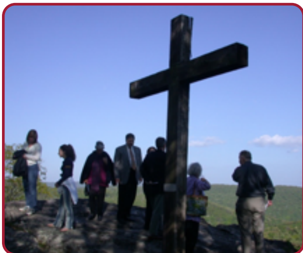
Pilgrims of Hope

“God, You are my place of quiet retreat. I wait for you to renew me.”