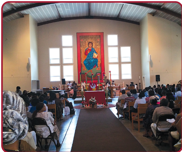
Holy Mass at Our Lady of Atonement Chapel

For many years Graymoor has been a place for prayer, reflection and Atonement Franciscan hospitality.