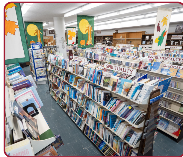
Graymoor Book and Gift Center is located on the 4th floor of Pius X (Administrative Building)

Graymoor is located on Route 9 in Garrison. We are 1-hour north of New York City; 5 miles north of Peekskill, NY; and 10 miles south of Interstate 84.