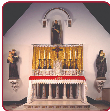
Discover the beauty of St. Francis Chapel