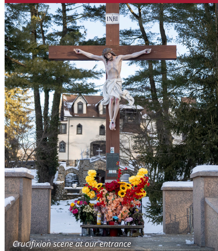
Crucifixion scene at our entrance

Home to the Franciscan Friars and Sisters of the Atonement