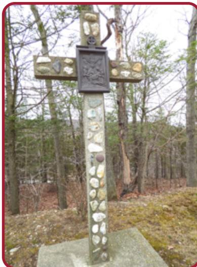
Take in the beauty of our outdoor Stations of the Cross and the Shrine of St. Anthony